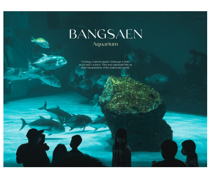
Bang Saen Aquarium & Museum