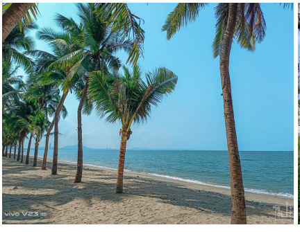
Bang Saen Beach