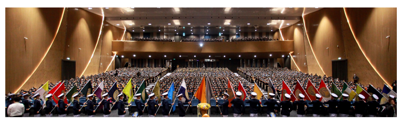
Thamrong Buasri Auditorium, Burapha University