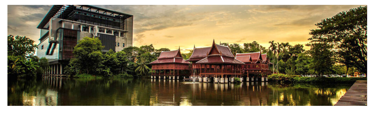
Mahidol Thai House, Mahidol University